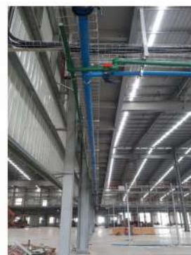
PPR Piping Installation