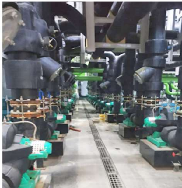
Wilo Split Case Pump for HVAC Application Installation