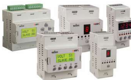
MIBRX - RAIL MOUNT