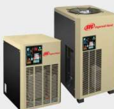
Small / Medium Non Cyclic Refrigerated Dryer