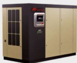
Rotary Screw Air Compressor Lubricated and Oil-free type 4 - 350kW | 3-14 bar g