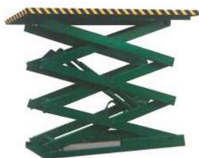
Stationary Hydraulic Lift Table