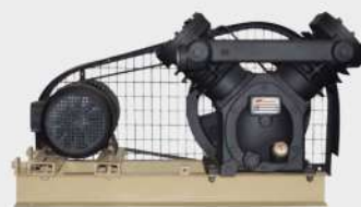
Ingersoll Rand Make Base Mounted Medical Vacuum Pump 2 to 10 HP for Hospital,