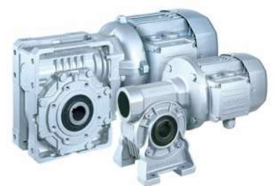
VF & W Series Worm Gears