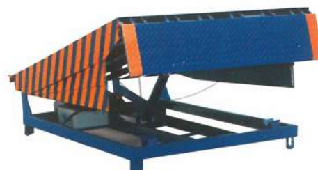
Hydraulic Dock Leveller