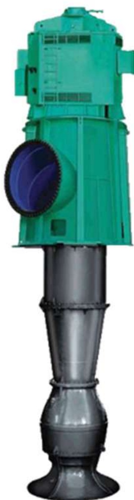
Vertical Turbine Pump