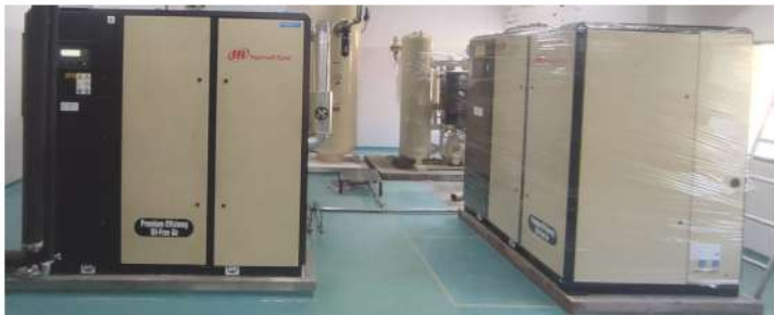
IR Oil Free Compressor Installation