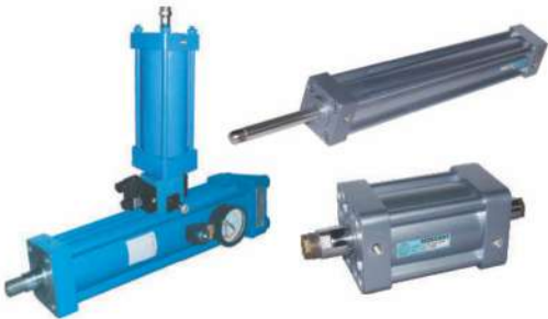
Pet Moulding Pneumatic Cylinders