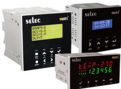
MIBRX - PANEL MOUNT