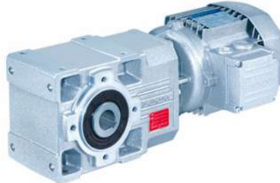
A Series Helical-Bevel Gearmotors