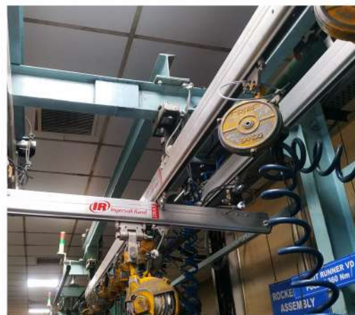
IR Rail Systems