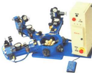
Hexagonal Marking Machine