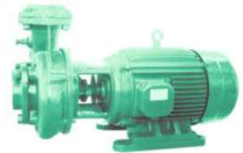
Non- Self Priming Mono Block Pump