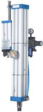
Hydro Pneumatic Cylinder