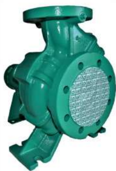
End Suction Back Pull Out