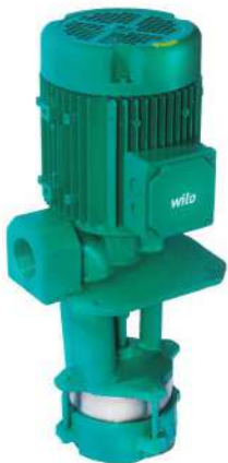
Coolant Pump Vertical Immersion Pump