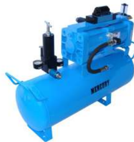
Air Booster Pumps