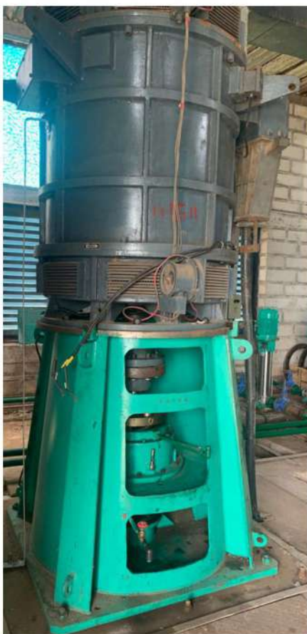
Wilo VT Pump for Lift Irrigation