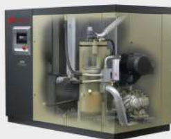
45-160 KW Premium Efficiency Nirvana Single Stage Rotary Screw Compressor Lubricated & Oil Free Type

A New Level of Reliability, Efficiency and Productivity