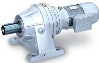
300 Series Planetary Drives