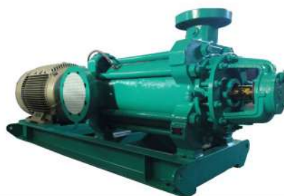
Multistage Ring Suction Pump (High Pressure Pump)