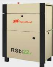
Next Generation RSB-Series 15-30 kW Oil-Flooded VSD Rotary Screw Compressors