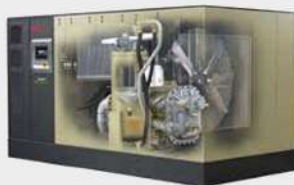
75-225 KW Super Premium Efficiency Nirvana Two Stage Rotary Screw compressor Lubricated & Oil Free Type