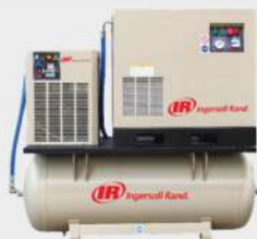
Next Generation RT-Series 7.5 to 11 kW Oil-Flooded VSD Rotary Screw Compressors