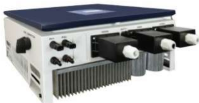
Solar Hybrid Grid Tie Inverter