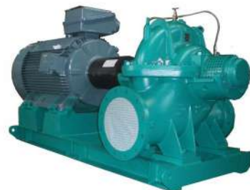
Horizontal Split Case Pump