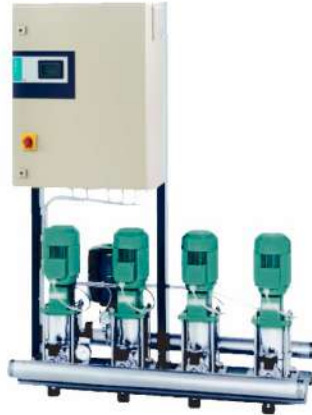
Multistage Booster Pumps