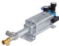
Hydro Pneumatic Pumps