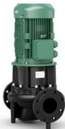
Horizontal Split Case Pump