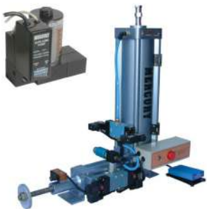
Oil & Grease Pumps