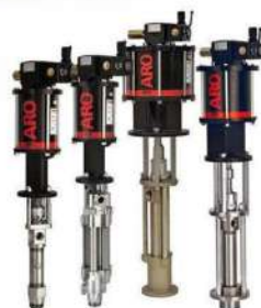
Pneumatic Operated Piston Pumps