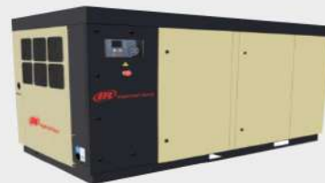
75-225 KW Super Premium Efficiency Nirvana Lubricated & Oil Free Type