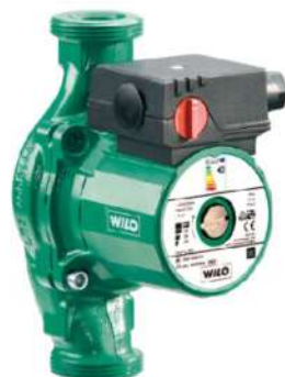
Hot Water Circulation Pump