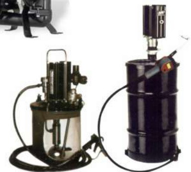
Oil Lubrication Equipment