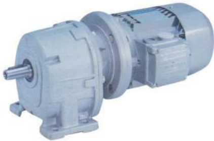
AS Series In-line Helical Gear Motors