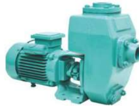
Self Priming Non Clog Pump Set