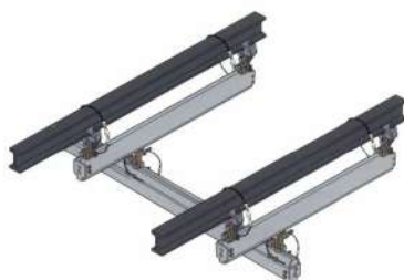
X-Y Rail System