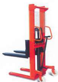
Standard Hand Stacker