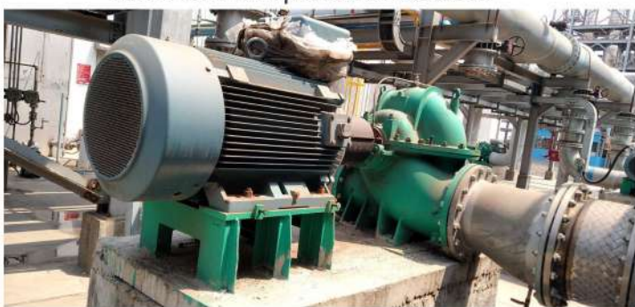
Wilo Split Case Pump for Condensate Water Installation