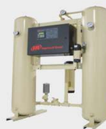
Dessicant, Heat of Compression (HOC)