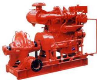
Fire Fighting Pump