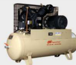
Air Cooled Reciprocating Compressor Lubricated and Oil-free type 0.75 - 22kW | 5-340 bar g