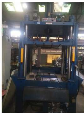
Mercury Hydropneumatic Press (5 to 30 Tonne)