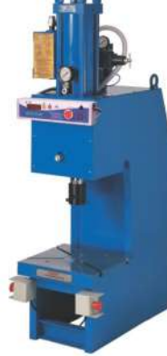
N Series C Frame