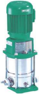
Multi Stage Inline Vertical Pump