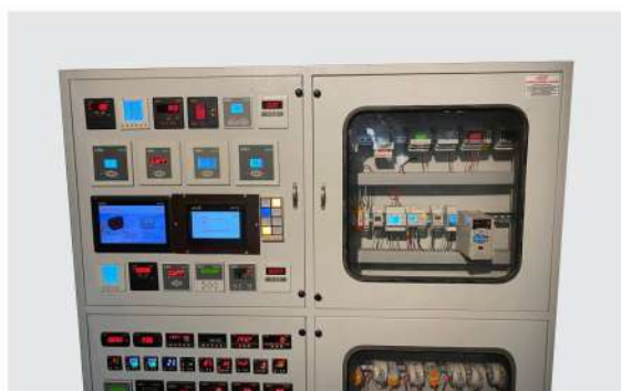
Selec Control Panel