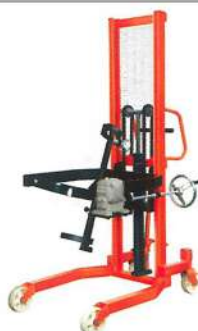
Hand Drum Lifter