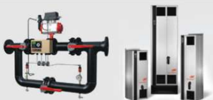
Energy Saving Controllers Electronic Flow controls Variable Speed drive Intelliflow