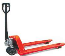
Hand Pallet Truck