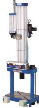
A Series C Frame, 2 Column