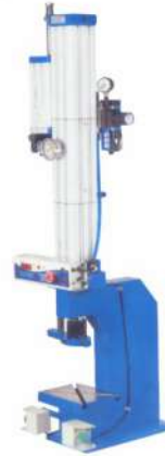
Compact C Frame